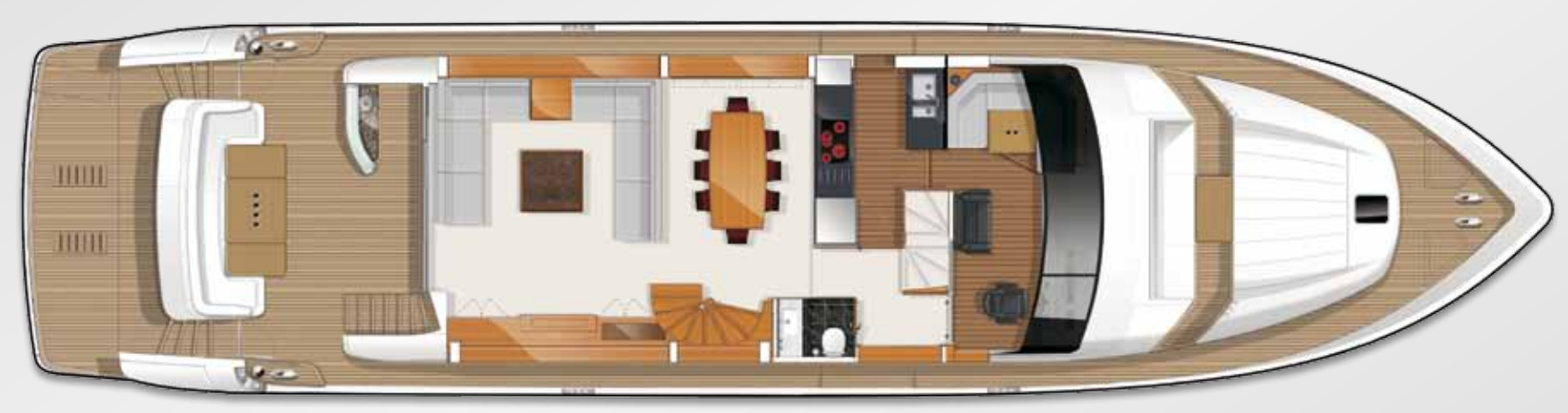
MAIN DECK LAYOUT