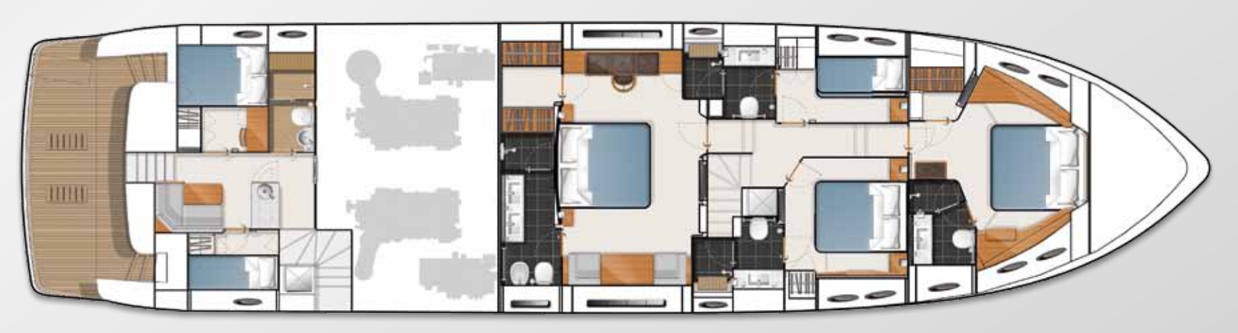
LOWER ACCOMMODATION LAYOUT